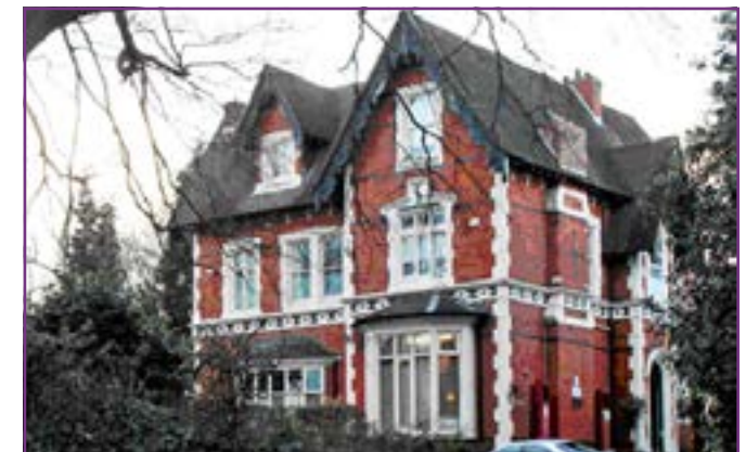
The Calthorpe Clinic in Birmingham

http://www.telegraph.co.uk/health/healthnews/9102232/Abortion-investigation-Doctor-admits-procedure-tantamount-to-female-infanticide.html