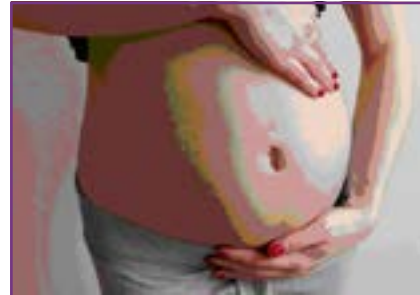
The young woman who attended Calthorpe Clinic with The Daily Telegraph. She is happily pregnant

that law but it is why — in discussion with all main parties — we are planning to consult on counselling arrangements for women seeking an abortion," he said.