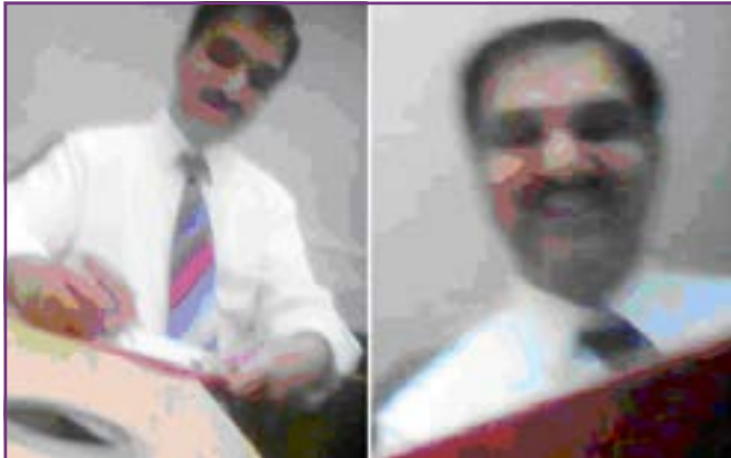
The doctor appeared happy to change the woman's reason for wanting an abortion when filling in forms