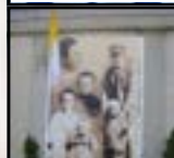
Pope John Paul