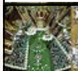
Infant of Prague