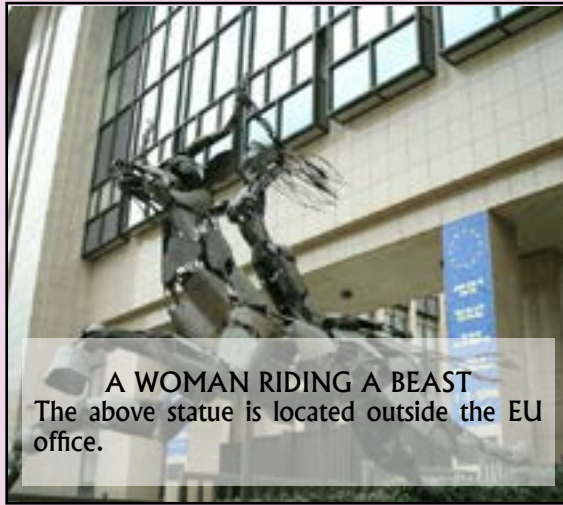
A WOMAN RIDING A BEAST The above statue is located outside the EU office.

Clearly meaning that the European constitution is not based on or given by God, but written by a pagan goddess. Cannot be more clear.