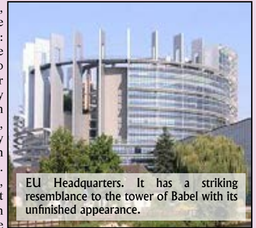
EU Headquarters. It has a striking resemblance to the tower of Babel with its unfinished appearance.

The Europe of today is like the Tower of Babel. It is attempting to go against God and believes it is invincible. If you look at the poster that was printed by the European Union, it has the Tower of Babel surrounded by twelve inverted stars (an inverted star is a satanic symbol) and it also has the motto 'EUROPE: MANY TONGUES ONE VOICE.' It was because of one voice that God destroyed Babel in the first place. He confounded the peoples and gave them different