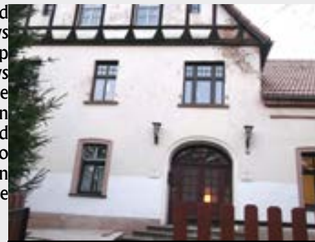
NEW WINDOWS AT SAINT STANISLAUS

Jesus also requested work to be carried out in the cellar where the furnace is housed. In order to get the furnace into the cellar, a massive opening had to be