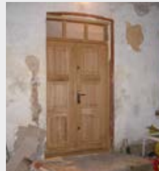
NEW BACK DOOR