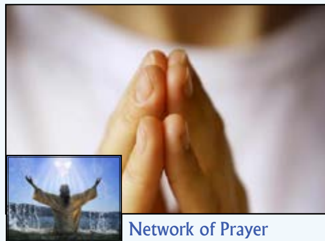
Network of Prayer

Are you in need of prayer or want someone to pray for someone you know, then log on to our new Network of Prayer on Facebook. Here you can put your requests for prayer and also help others by praying for them.