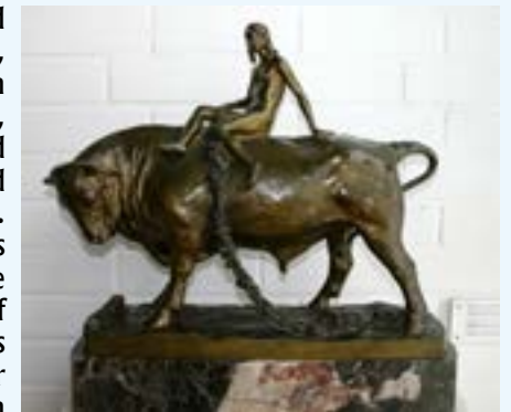
The goddess Europa outside parliament buildings.

the fragmented human race went off to populate the various parts of the world, as God intended it should, taking with it its various garbled forms of idoltrous belief. So if underlying most of the world religions is the unity of paganistic superstition that men shared as they built the Tower, so much easier then can we envisage their rediscovering the common roots of their beliefs.