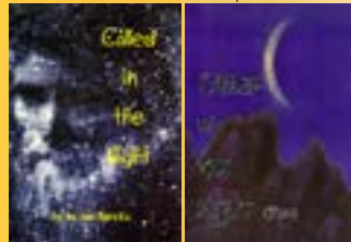
Called in the Night Books One and Two Price: £2.50, €3.00 (plus P&P)