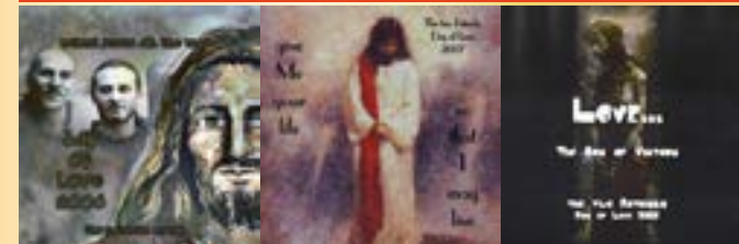
• Day of Love 2006 • Day of Love 2007 • Day of Love 2008 All the CDs are only: £10.00, €11.50 except the Day of Love 2008, as it is three disks, it is priced £15.00, €17.50 (plus P&P)