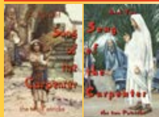
Song of the Carpenter Books One and Two Price: £6.99, €8.00, (plus P&P)