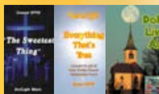
• The Sweetest Thing Concert • Everything That's True Concert • Dole Live Aid Price: £12.00, €15.00 (plus P&P)